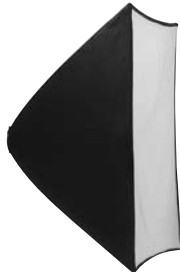
53.409.00 Soloflex 100 100 x 100 cm (40 x 40")