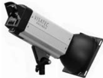
51.010.00 SOLO 800 B 110-120 V