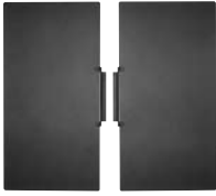
53.221.00 Barn doors for softlight reflector