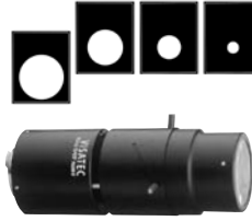
53.130.00 Projection attachment Solospot 800 B/1600 B with flash tube, protecting glass, gobo holder and masks