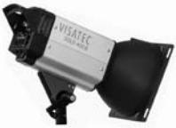
51.130.00 SOLO 400 B 120 V

All monolights with protecting glass and grey protection cap