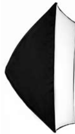
53.417.00 Soloflex 60 x 90 60 x 90 cm (24 x 35")