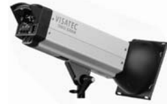
51.104.00 SOLO 3200 B 110-120 V