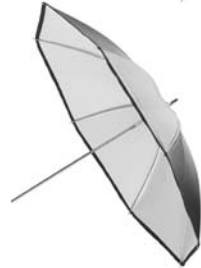
53.450.00 Umbrella, white