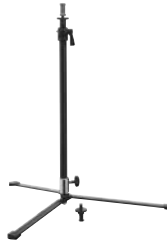
55.102.00 Floor stand