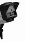
51.052.00 LOGOS 1600 RFS 200-240 V bi-voltage