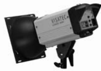
51.050.00 LOGOS 1600 200-240 V bi-voltage