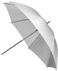
53.451.00 Umbrella, transparent