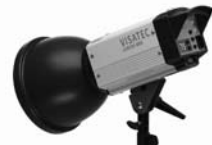
51.070.00 LOGOS 800 BC 200-240 V bi-voltage