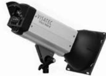
51.102.00 SOLO 1600 B 110-120 V