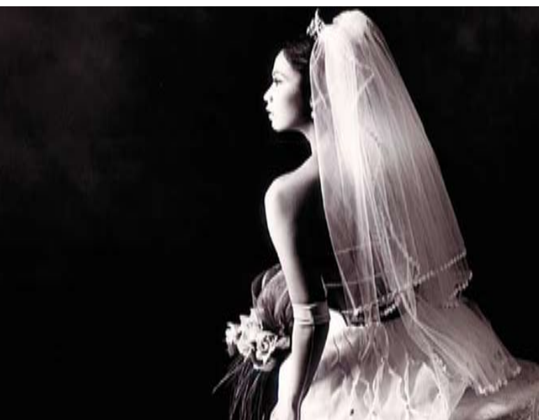
Frida-Orkid Studio, Indonesia

A comprehensive selection of accessories can be exchanged quickly and easily using the VISATEC bayonet mount. All reflectors can be rotated 360°, an advantage especially with barn doors and rectangular reflectors.