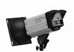
51.040.00 LOGOS 800 200-240 V bi-voltage