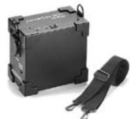
56.302.00 Powerbox 900