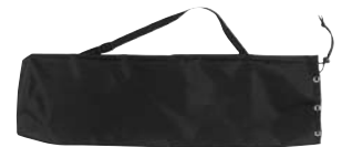
56.550.00 Bag for stands