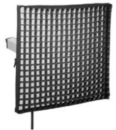
53.202.00 Fabric grid Lighttools™ for Soloflex 80