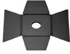
53.121.00 Sunlite attachment