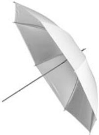
53.453.00 Umbrella, sun