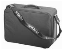
56.503.00 Travel bag empty for VISATEC Kit 108