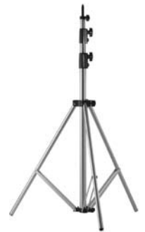
55.103.00 XL stand