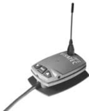
56.202.00 Transceiver RFS