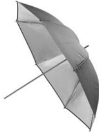
53.452.00 Umbrella, silver