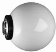
53.122.00 Globo UV coated acrylic glass sphere, ø 30 cm (11.8")