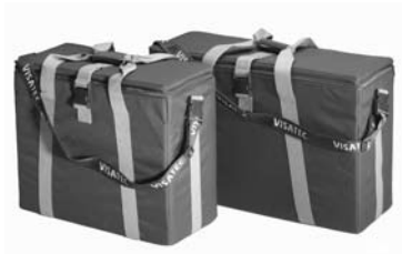
56.506.00 Travel bag empty for VISATEC Kits 204, 208, 216