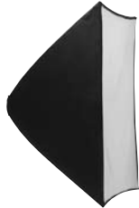
53.408.00 Soloflex 80 80 x 80 cm (32 x 32")